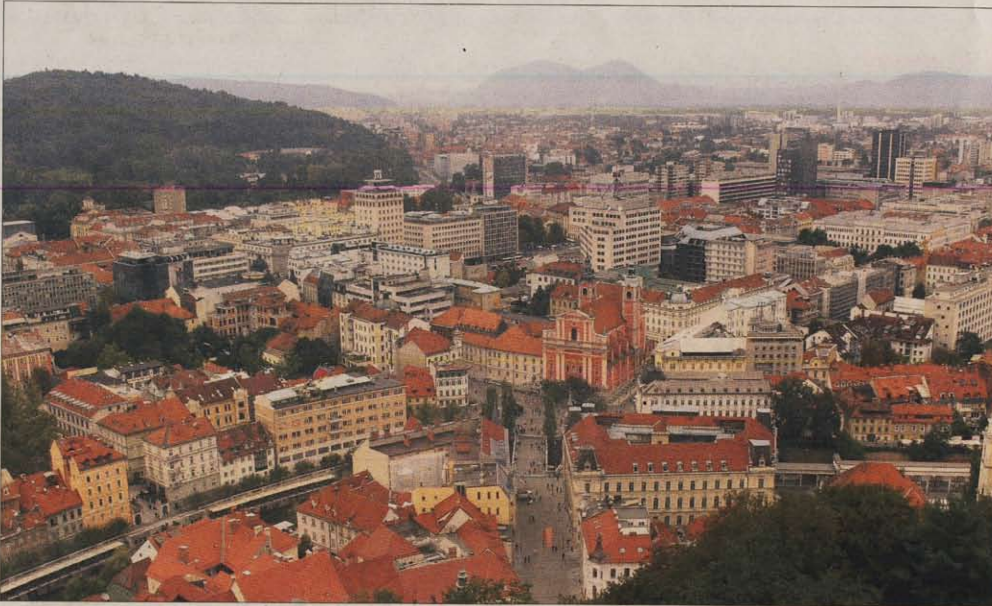
PRETTY AS A PICTURE: A view of Ljubljana from its castle.