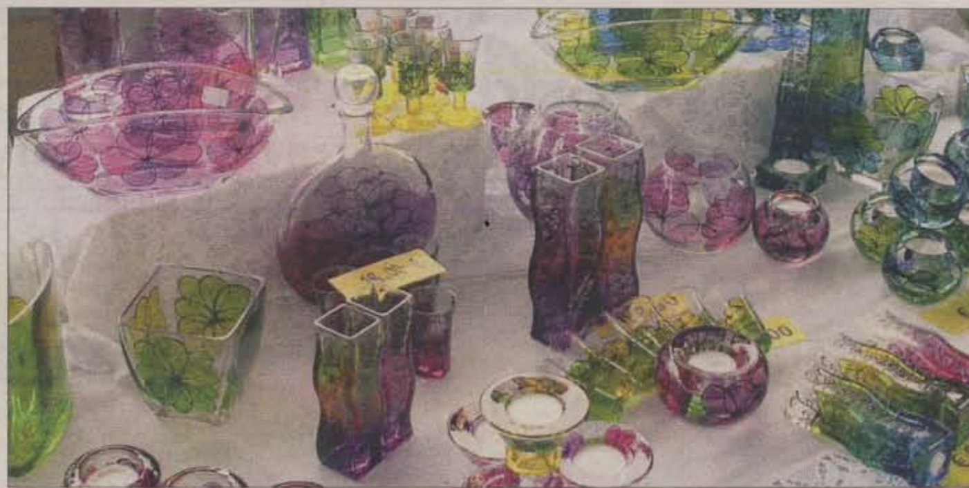
PRETTY BAUBLES: Take home Ljubljana's functional glass art as a souvenir.